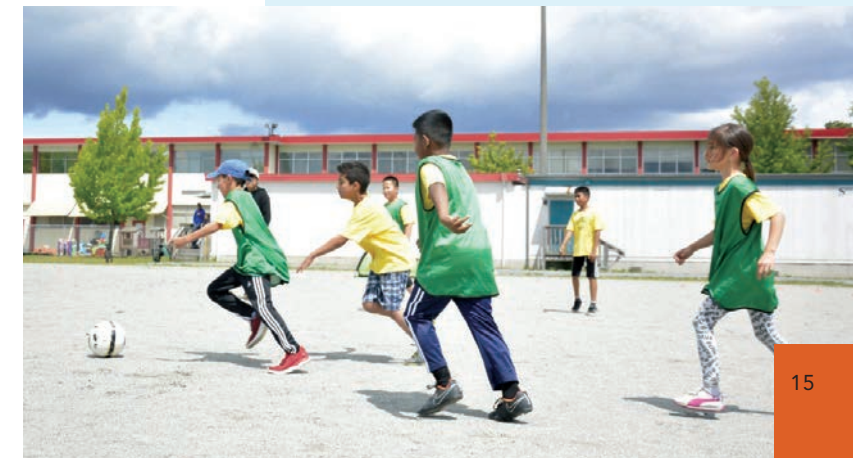
Burnaby MoreSports gives children the chance to experience sports without barriers