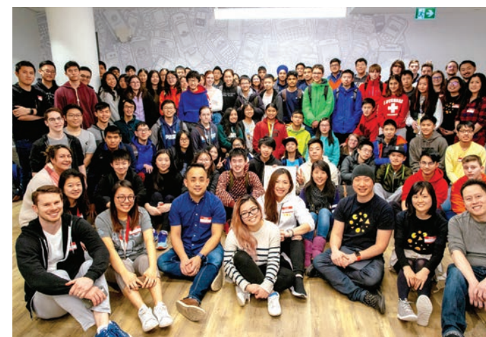
Game of Apps bringing mentors and students together, February 2020