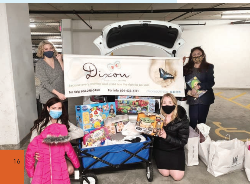
Dixon Transition Society Holiday Sponsorship 2020