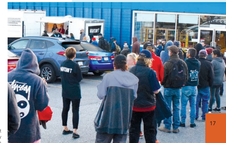
NightShift Street Ministries community outreach